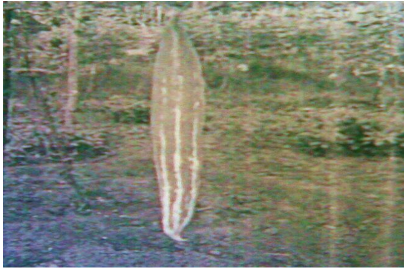
Fig. 1. Snake Gourd Fruit (LAUTECH Agric. Engr. Farm)