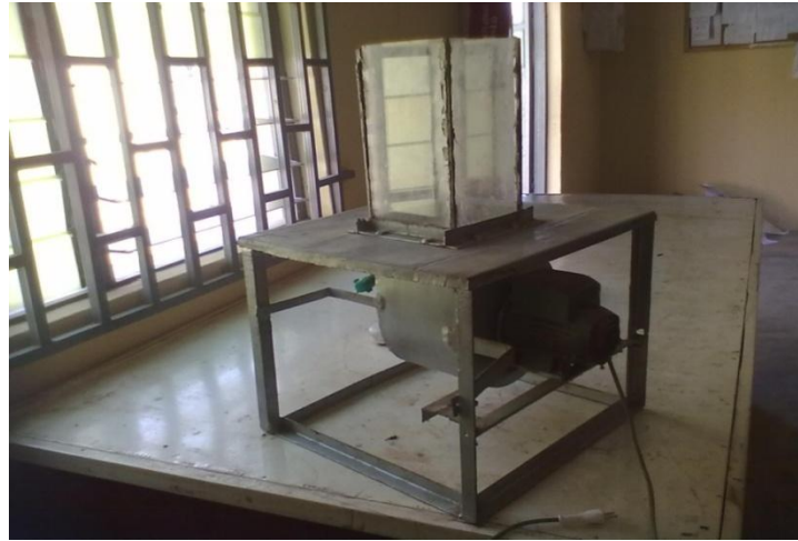
Fig. 3. Wind Tunnel for Measuring the Terminal Velocity