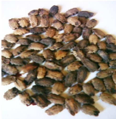
Fig. 2. Snake Gourd Seeds

The snake gourd seed oil contains 26.2-26.6% crude protein, 44.6-57.7% fat, 7.8-8.15% phosphorus and 0.012-0.026% anti-nutritional oxalate (Adebooye et al. 2005). The oil content compared favourably with that of most seed oil. They noted that its anti-nutritional oxalate is low and safe for humans but the seed has not been exploited as there is dearth of information on the aerodynamics properties of the seed which will be used in the design of machine that will clean and separate the seed, the kernel and chaff during dehauling of the crop.